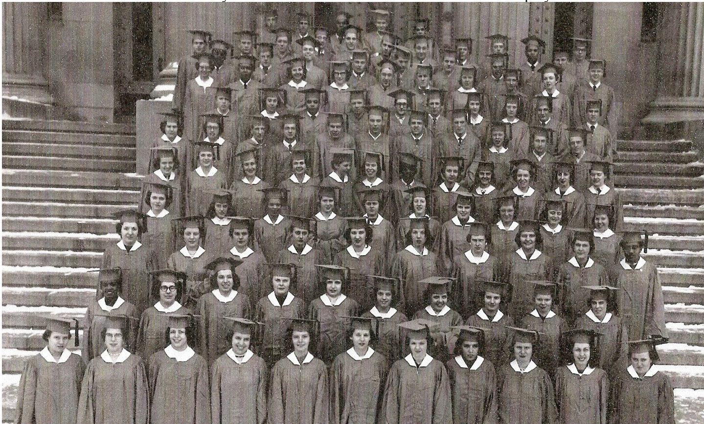
This is the January EHS Graduating Class of 1956. I was not sent any names. (looks awful cold & snowy, Brrr) Enjoy!

8. What EHS coach and early 40’s graduate was a Professional baseball player for the Giants?